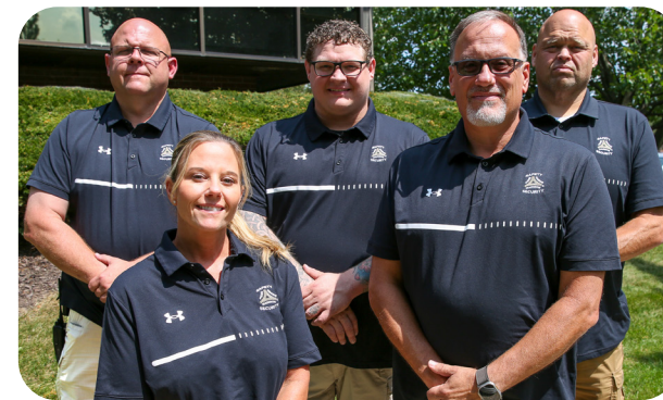
P-H-M Safety Team: Former Police Officers with extensive experience working with students