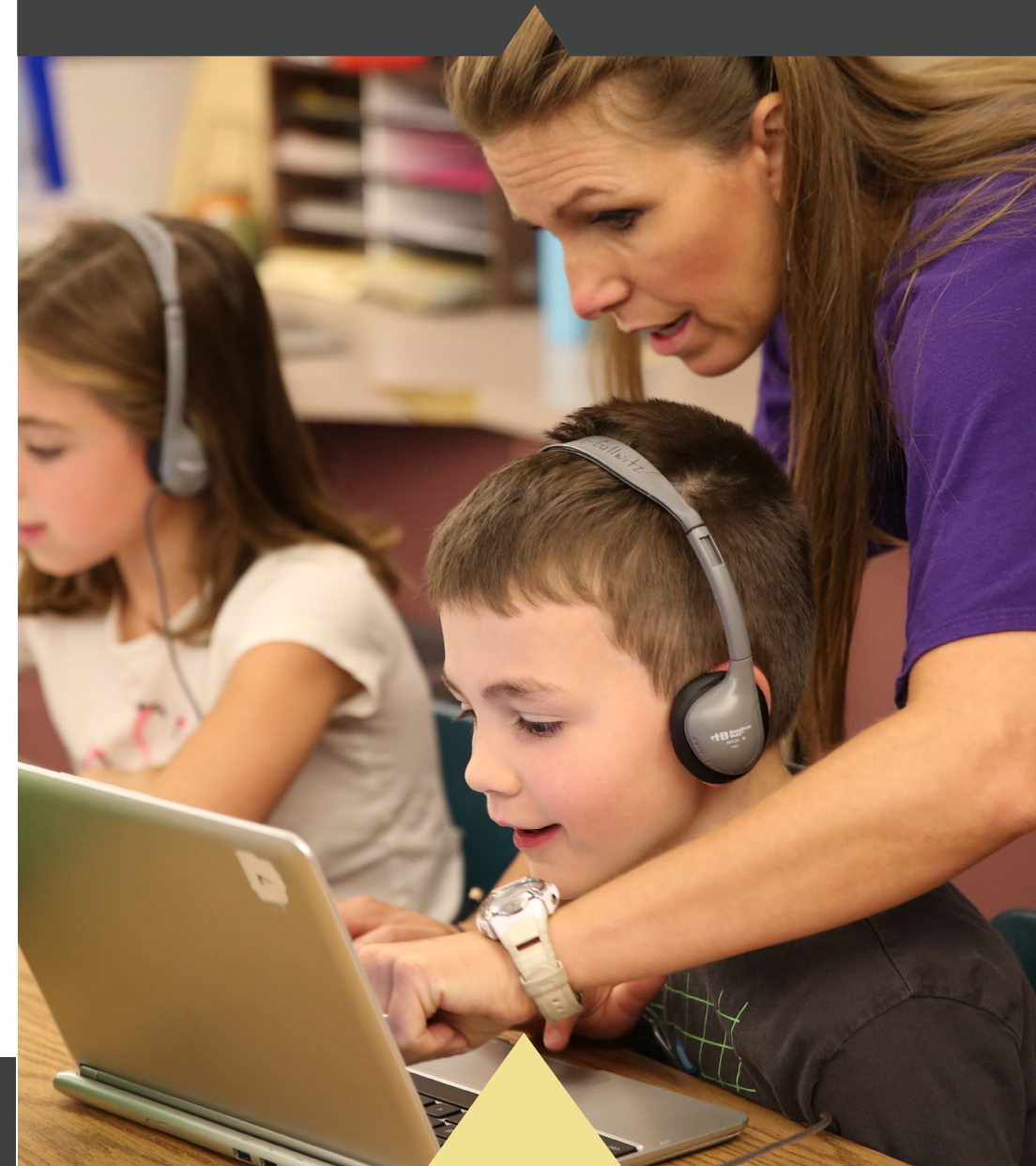
P-H-M's Triangle of Success Connecting Students, Teachers and Parents for Excellence in Education